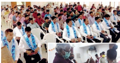
Trained volunteers for outreach ministry

The people who accepted Jesus Christ are sharing the Word of God in their villages after going back to their respective states and they are in constant touch with us. And three of them have even donated their lands to build a Church in Purulia in Bengal, Lakisari in Bihar, and Sirsai in Assam.