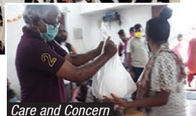
Care and Concern