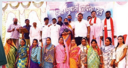
Khandeshi Bhili believers with dignitaries