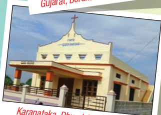
Karnataka, Dhundsi - 15.05.2017