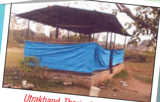
Uttarakhand, Thari - 25.07.2017