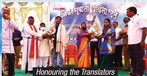
Honouring the Translators