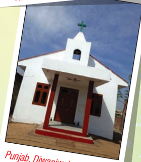
Punjab, Diwaniwal - 24.08.2017