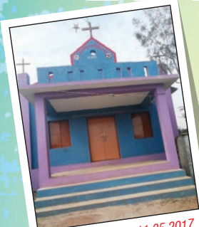
Gujarat, Bordha - 11.05.2017