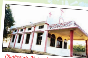
Chattisgarh, Bhalupakhna - 02.08.2017