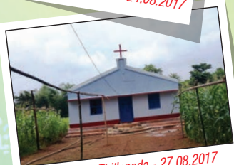
Jharkhand, Thillepada - 27.08.2017