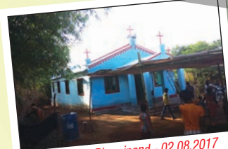
Jharkhand, Dharnipand - 02.08.2017