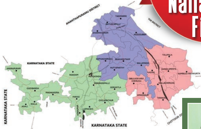
Map of Sri Sathya Sai District