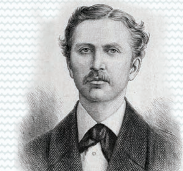
Alexander Murdoch Mackay

Mackay often questioned what an engineer like himself could contribute to undeveloped Africa. On December 12, 1875, he read a letter in the Daily Review written by Henry M. Stanley, who had gone searching for David Livingstone. The letter conveyed the King of Uganda's desire to learn about the God of the white men. Stanley wrote that the person ready to cure diseases and build houses