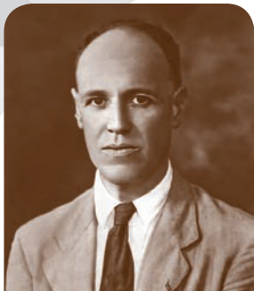
James Oliphant Fraser